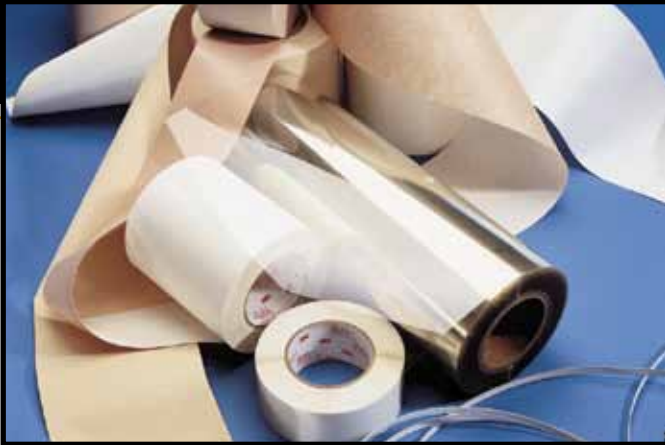
Adhesives for medical device applications include acrylics, epoxies, and styrene block co-polymers.