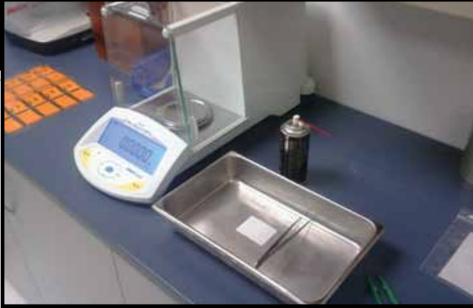
Scale measures accurate coat weight (material plus adhesive coatings).