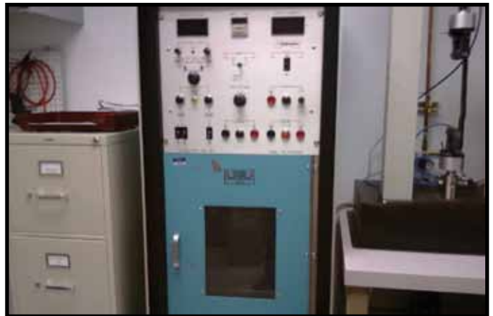
Dielectric testing measures the value of a material as an electric insulator.

For materials and adhesive inspection, Fabrico uses a MOTIC DM 143 Digital Microscope with CCD video output to characterize materials and adhesive bonds. Side-by-side comparisons can be made for differences in test materials over a specified time period.