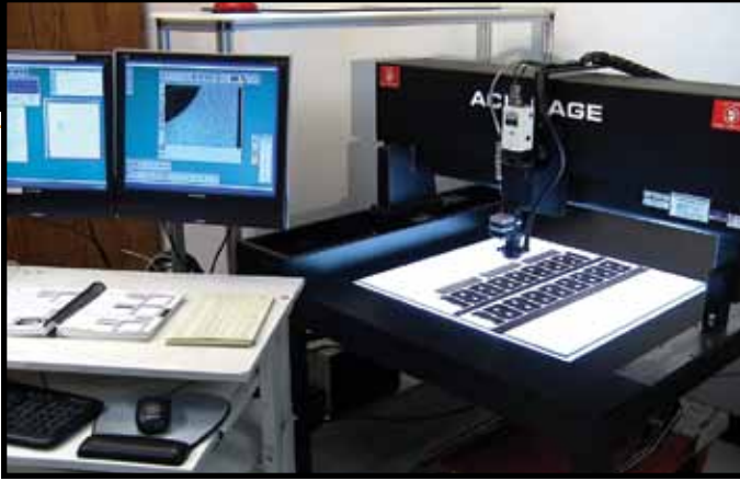
Fabrico's video measuring system for part dimension verification.

In many cases, design engineers select the materials they want to use at the start of the design process and treat the selection of adhesives as an afterthought. This can lead to a design where the adhesive is constrained by the materials. Proper material and adhesive testing and selection for engineering applications can be the difference between project success and failure. Factors about the adhesive chemistry, substrate chemistry, long term environmental conditions, and the long-term stresses on the bond, can affect the durability of the bond over its planned lifetime.