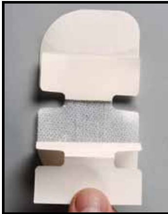
Hydrocolloid adhesives provide new alternatives to traditional dressings with fluid absorption, skin-friendliness, and durable adhesion.

Advances in adhesive formulations are providing design engineers working with medical products the ability to deliver skin-friendly solutions for short- and long-term wound care, surgical dressings, and ostomy applications. Hydrocolloid adhesives provide new alternatives to traditional dressings where characteristics such as fluid absorption, skin-friendliness, and durable adhesion over multiple days, are critical.