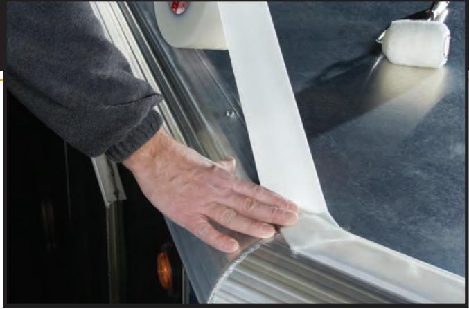
3M™ VHB™ tape provides easy panel joining for the exterior of the RV.

3M™ VHB™ Tape has a high peel strength and forms strong bonds, resists moisture and solvents, and can stand-up to UV light. It provides an invisible bond that delivers a smooth exterior surface, perfect for painting and custom graphics. It is easy to handle and is slit to precise widths by Fabrico for fast application. The 3M™ VHB™ tape also provides easy panel joining for the interior of the RV.