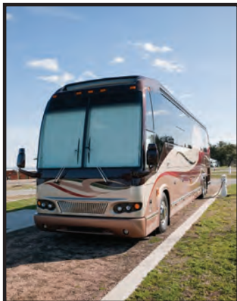
From repair to complete remodeling, selecting the right adhesive is critical on luxury RVs.

Despite the recession, sales of luxury motor homes — recreational vehicles, tour buses, movie trailers for stars — have increased by 87.5% from March 2009 to March 2010. As new RVs are rolling out, existing vehicles are coming in for repairs and refurbishment. Repair shops are committed to making an owner’s “rig” look great. They are highly skilled in interior work as well as outer body part replacement, fiberglass repair, and laminated wall repair. For RV repair companies, meeting the expectations of their exacting customers for quality work and luxurious appointments includes working with an experienced materials and adhesives partner.