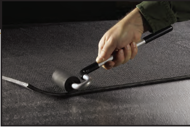
Adhesives provide excellent bonding for RV carpet replacement, cabinet and counter top installation, and shower and tub replacement.

A pressure-sensitive, conformable, double-sided tape can replace rivets or welds for exterior panels.