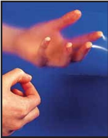
Polyolefin materials are increasingly used in the manufacture of medical devices, including surgical/steri-drapes.

For design engineers focusing on wound care, ostomy appliances, surgical drapes, and medical diagnostics, it becomes increasingly important to work with materials experts who can access a broad range of adhesives and materials to meet unique application requirements.