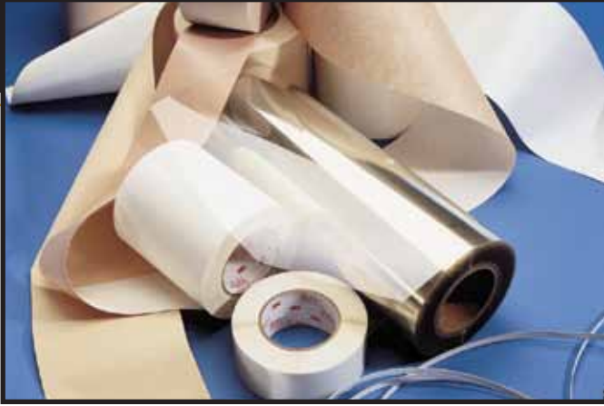
Adhesives for medical device applications include acrylics, epoxies, and styrene block co-polymers.