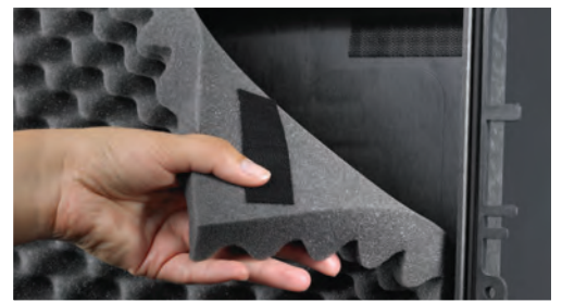
3M's Scotchmate reclosable fastener offers superior hook-and-loop fastening for various indoor and outdoor applications.

Fabrico and 3M also provide custom Scotchmate reclosable fasteners for standard hook-and-loop fastening applications. Scotchmate reclosable fastener features stiff hooks that mesh with pliable loops to create quick and easy closure for many indoor and outdoor assembly applications, including displays and exhibit booths, home and commercial offices, and automotive interiors. Scotchmate reclosable fastener is available in rolls, pre-fabricated parts, and custom fabrications.