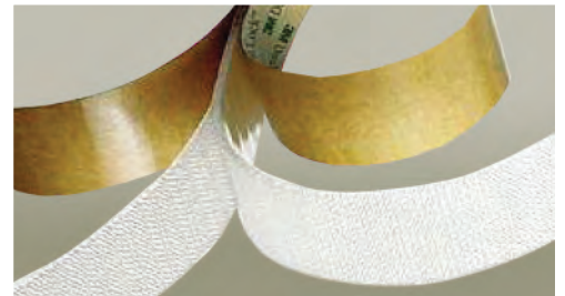
Fabrico uses water jet technology for custom slitting and cutting of the high-performance Dual Lock reclosable fastener.