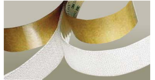
Fabrico uses water jet technology for custom slitting and cutting of the high-performance Dual Lock reclosable fastener.