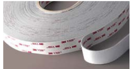
3M™ VHB™ Tape is ideal for replacing screws, rivets, and spot welds in permanent, high-strength bonding applications.