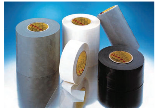
Unique non-woven micro fiber backing allows for conformability, elasticity, compressibility, and durability for excellent noise reduction.

Application is by hand. The 3M Conformable Sound Management Film Tape is applied to the perimeter of a passenger airbag cover (or other plastic component) after the decorative vinyl covering is attached. Finished parts are shipped to the OEM assembly plant for installation on the assembly line.