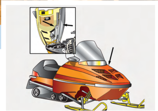
3M Aluminum Foil Tape protects parts and riders from high engine heat.

Die-cut aluminum foil tape can be applied by hand during the assembly process. The tape conforms easily to irregular shapes and sizes.