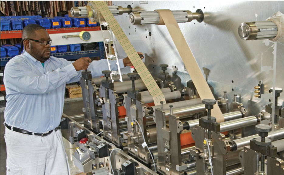
Fabrico's Delta Rotary Press at the company's Kennesaw, GA facility, is used for die cutting, laminating, and single-color printing.